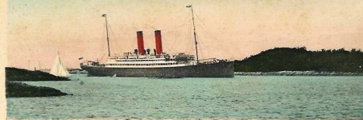
Bermuda, S.S. "Bermudian" passing through "Two Rock" passage.